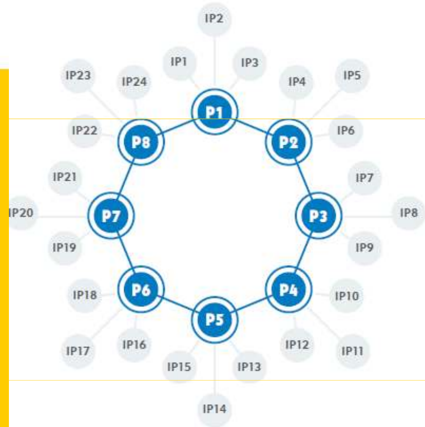
FIG. 2. THE GENERATION BALT NETWORK STRUCTURE

20 new network members via Letter of Intent